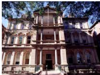
Royal Prince Alfred Hospital