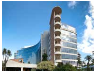
Concord Repatriation General Hospital