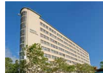
Sydney Dental Hospital